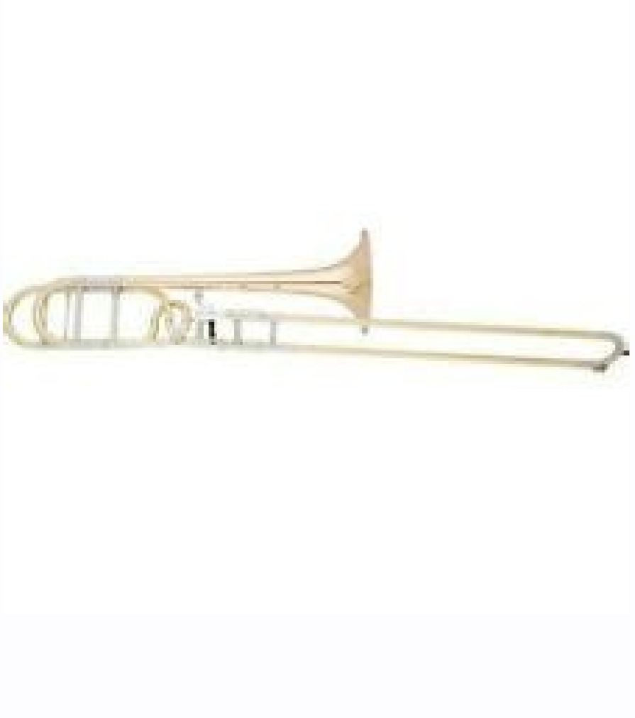
Bass trombone eBay.