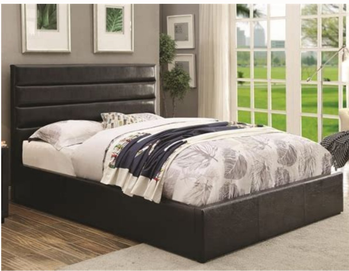
Royale upholstered platform bed with nail trim headboard king. Upholstered platform bed king no headboard. King size platform bed frame with upholstered headboard. Mr. Kate Daphne upholstered bed with headboard and modern platform frame king. Zinus Corey 38 metal platform bed with upholstered headboard king. King size platform bed frame with headboard upholstered tufted wooden slats. Brookside Ivy wood platform bed frame with upholstered headboard - king. Driftwood sand beige upholstered king platform bed with tufted arched headboard.