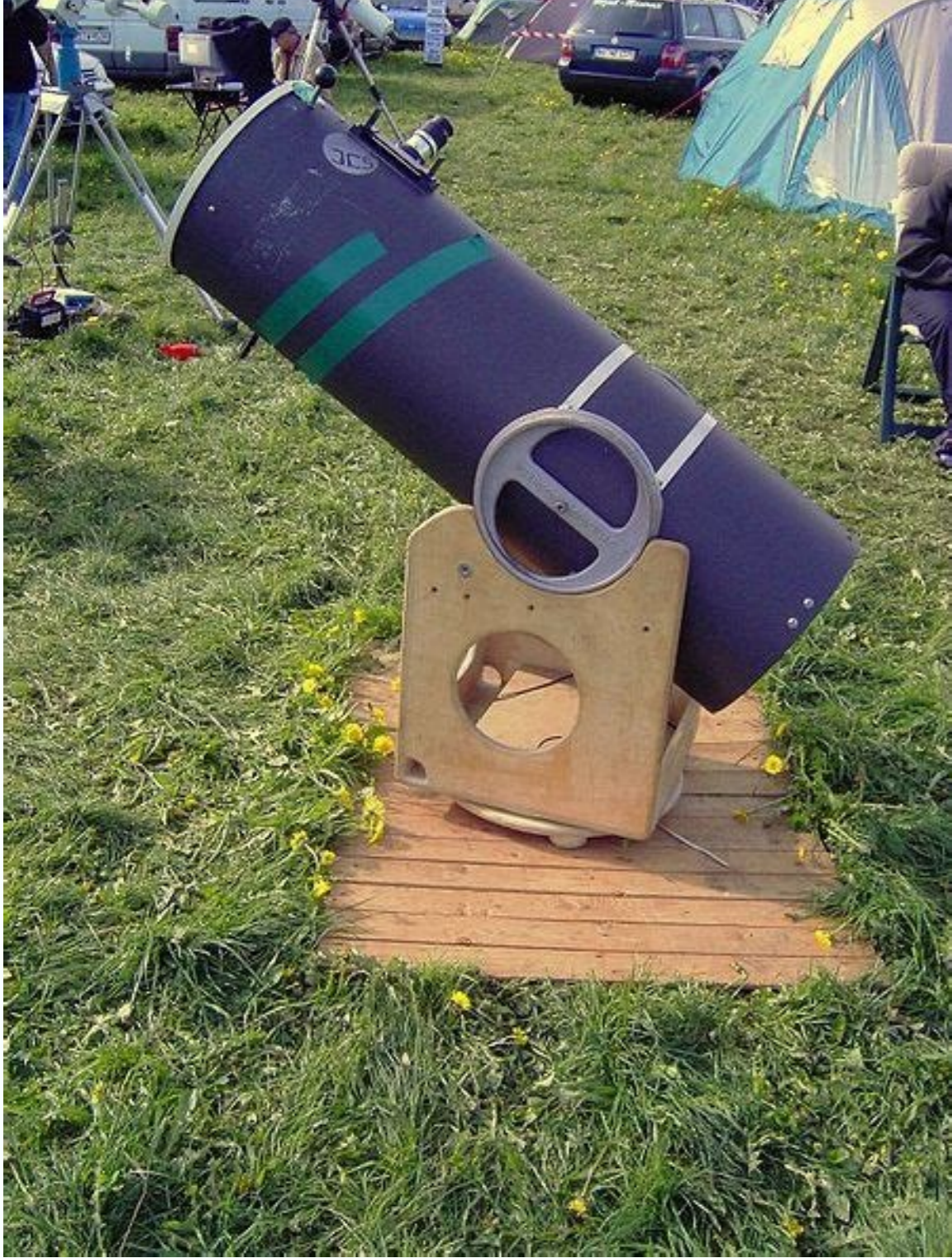
Comment fabriquer un telescope dobson.